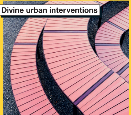
Divine urban interventions