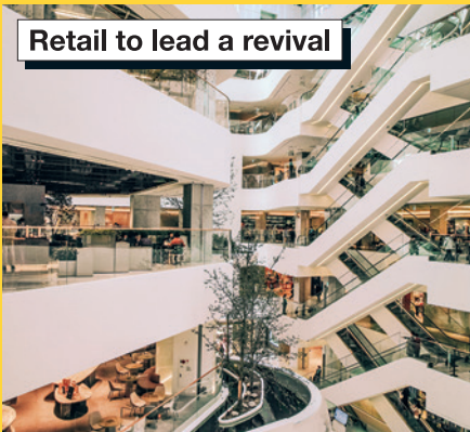
Retail to lead a revival

(PLUS: Making a scene at Studio Babelsberg, Europe's Hollywood)