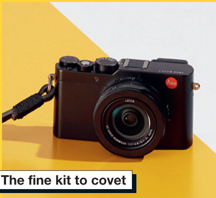
The fine kit to covet