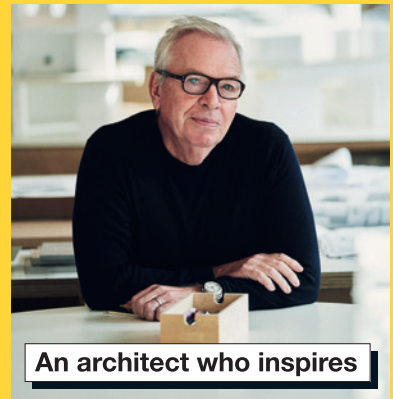
An architect who inspires

0 5 UK £7 USD $14 DE/AT €12 CHF 13 DKK 129.95 FIN €12 BENELUX €12 JPY ¥2,200 (tax inc) ES/IT €12 AUD $16.00 (tax inc) SGD $19.90 (tax inc) CAD $19.00 (tax inc)