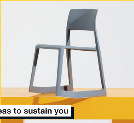
Ideas to sustain you

M A to F AFFAIRS: The mayor rethinking Helsinki BUSINESS: How to fix co-working spaces CULTURE: Art apartments DESIGN: Simply the best ENTERTAINING: Portuguese porkers and oysters FASHION: Top draw: fashion's illustration revival