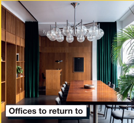
Offices to return to