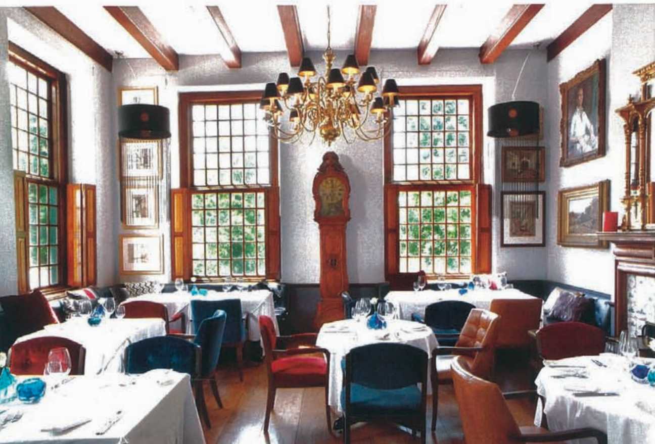
LEFT: 5 Rooms, a restaurant at the Alphen Hotel. ABOVE, LEFT TO RIGHT: Housewares at L'Orangerie. Kirstenbosch National Botanical Garden. A storefront in De Waterkant Village, a historic district near the harbor.

In this town, the citizenry blazes trails in venues such as the Hemelhuijs cafe, where waiters deliver black-tea-and-bergamot lattes garnished with dulce de leche and sea salt. Rooms at the Hotel Alphen, a whitewashed colonial manor, have Pop Art–scaled still lifes, gilt-edged mirrors, and sexy tufted headboards. At the edgy Test Kitchen, dishes such as foie gras with rabbit ham and vanilla-poached quince steal the show. "The energy here," says Merkle, "is intoxicating."