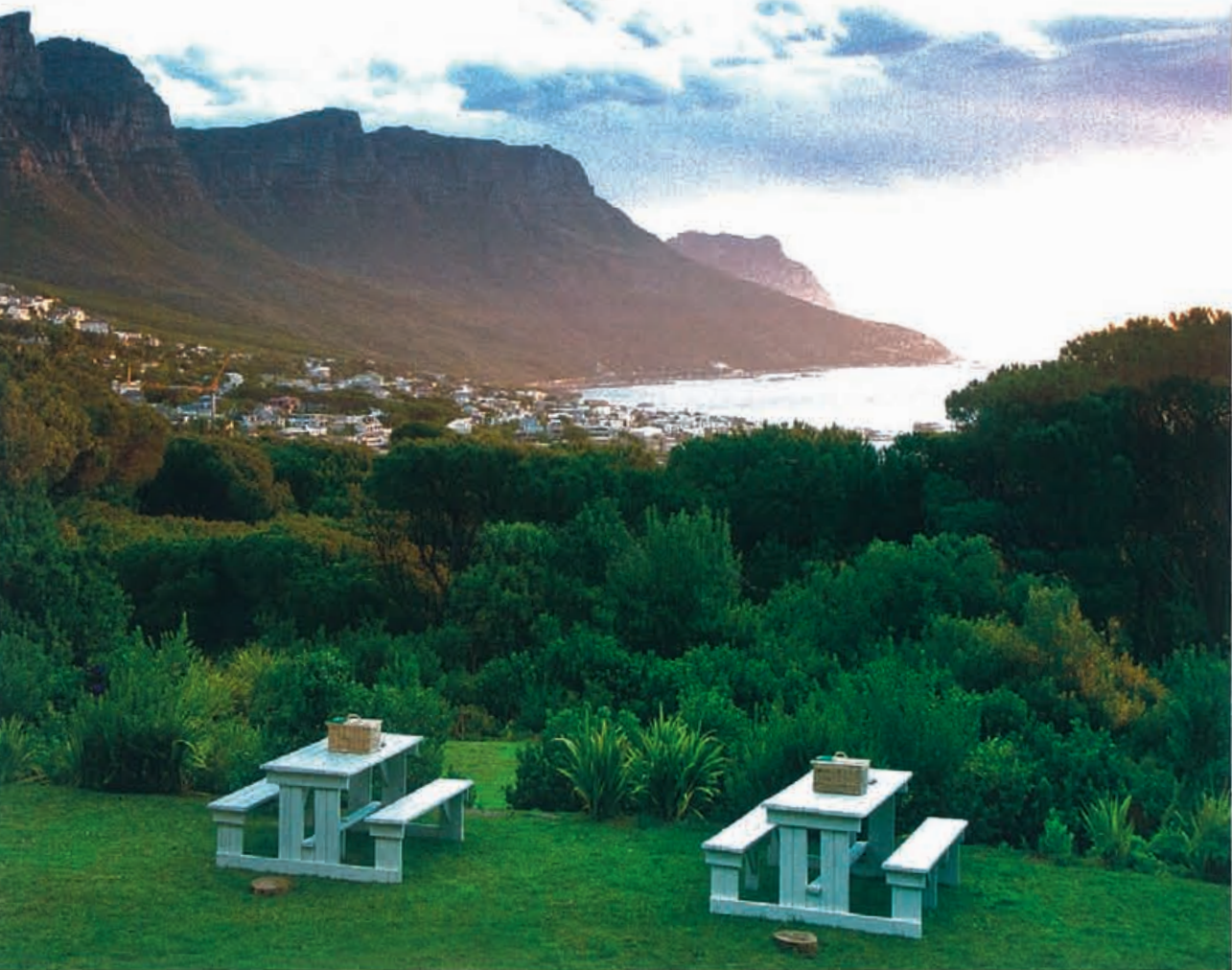
A view of Camps Bay and the Twelve Apostles mountains from the terrace at the Roundhouse Restaurant.