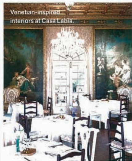
Venetian-inspired interiors at Casa Labia.

home,” and the café is an incredibly chic jewel box: sunny, with glinting oak-and-metal tables, staghorn ferns, orchids. Don’t miss the basalt pottery on which they serve the fresh, uncomplicated food—it’s also for sale. 71 Waterkant St., De Waterkant, 011-27-21/418-2042.