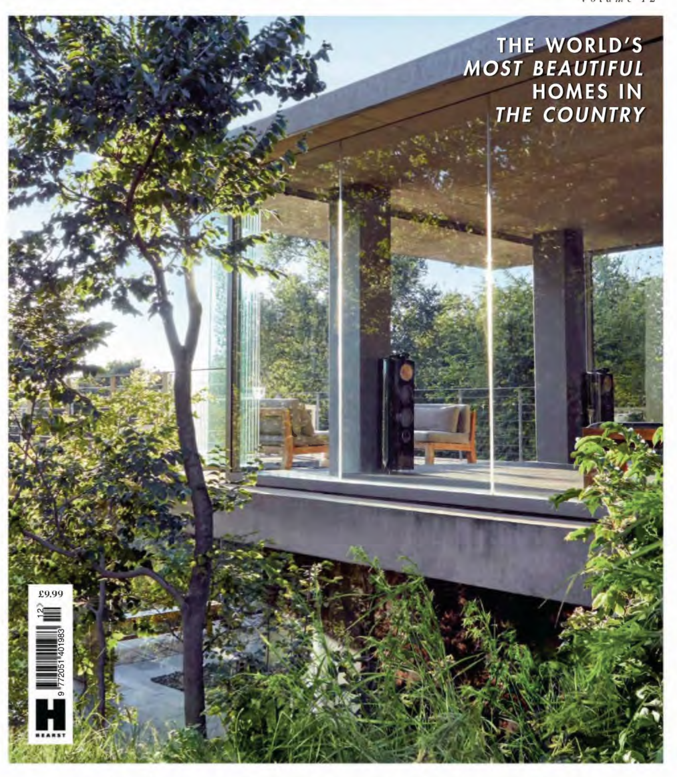
modern design / rural retreats / coastal havens / country classics PLUS 51 essential buys for your home