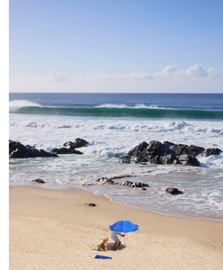
Opposite The clean lines of the kitchen, where many meals and coffees are enjoyed during Charl's stay. The stainless steel surfaces offer a contemporary touch, creating an instantly modern mood. This page Picasso, his lovers and friends would have approved of the views.

As we wander towards our cottage, we walk past another quintessential and now iconic trademark of the Babylonstoren signature: a blue-tiled pool, one half covered in glass and connected to a sauna and steam room, and the other exposed to the outdoors and sun. I end up running between all of these, on repeat, a couple of times during my stay. Literally into the blue.