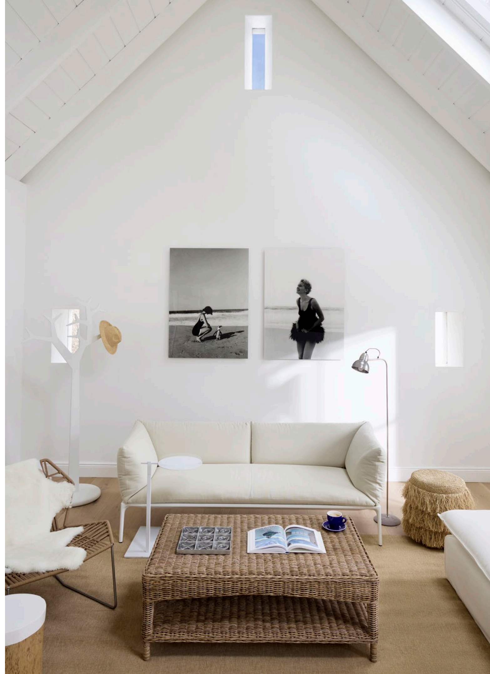
This page, clockwise from top left Charl admiring some decorative dolphins, just one of the many design details that make this property so special. One of the kid's rooms in the attic. The clean lines and minimalist decor of one of the master bedrooms. Opposite The living room's calm and crisp colour palette.