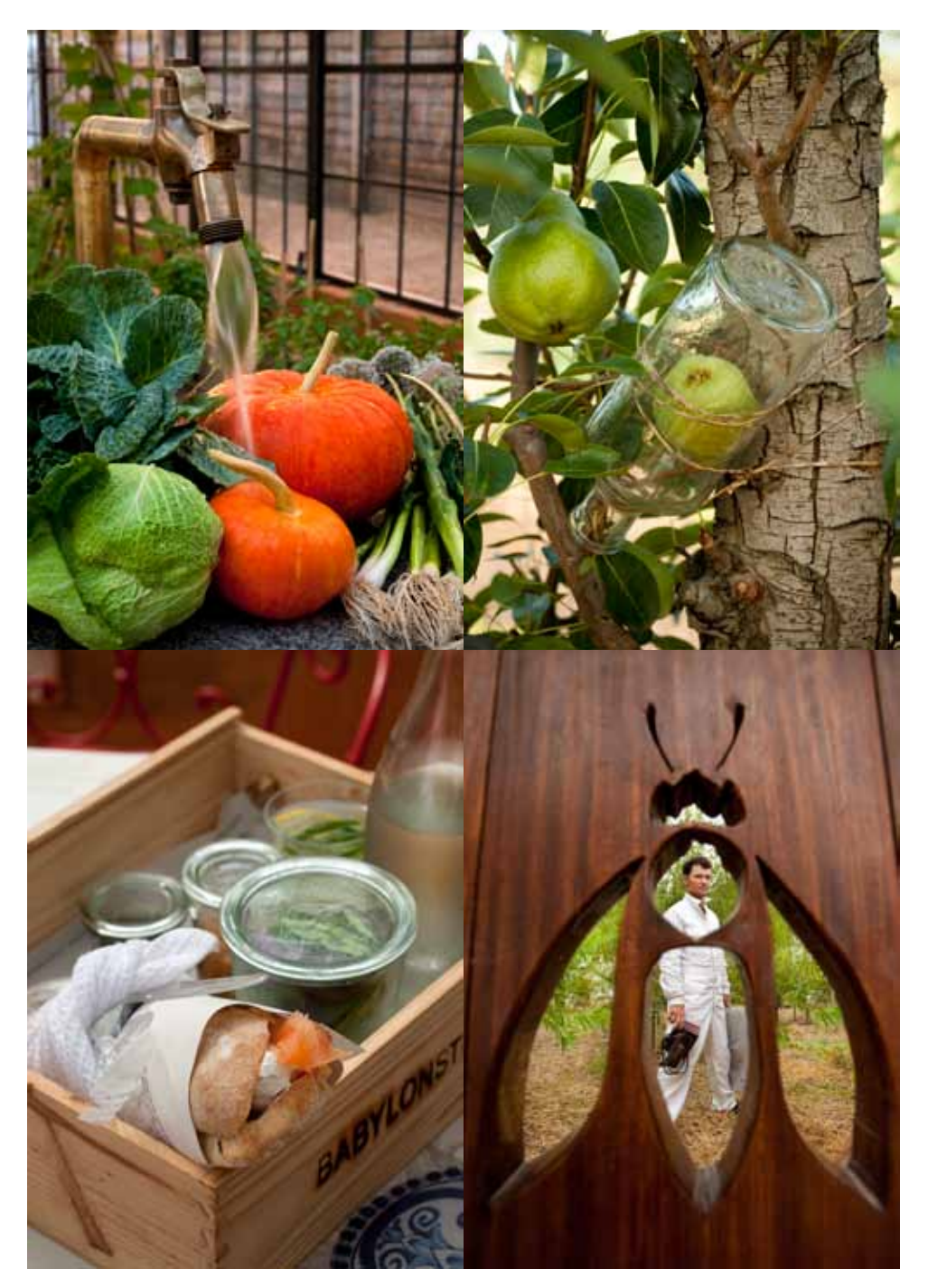
CLOCKWISE FROM TOP LEFT Pumpkins, cabbage and onions from the garden; A few small pears were covered with glass bottles in November to make pear wine or brandy; Babylonstoren's beekeeper, Voytek Modrzewski, seen through the door of the beehive; Lunch for one: a fresh salmon and yoghurt cheese sandwich wrapped in a paper placemat, with imported Weck glass containers filled with garden salad and baby vegetables, yellow plum chutney and herb oil. OPPOSITE The conservatory was erected between massive existing English oaks. Additional medium-sized turkey oaks and Algerian oaks were planted to provide extra shade in summer.

A place where you just want to sit and drink tea and enjoy the