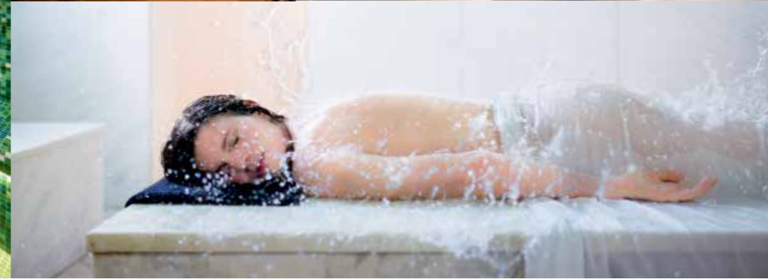
CLOCKWISE FROM OPPOSITE PAGE TOP LEFT: Taking inspiration from the gardens, the Rasul's curved walls are tiled with mosaics in calming botanical green tones. Hands are given a pampering pre-manicure wash. The hammam has a vibrant blue mosaic ceiling, heated marble walls and two marble treatment slabs. The hammam's ancient Turkish cleansing treatment is supremely good at relieving stress, increasing circulation and helping tired muscles to ease and relax.

addition, the Hot Spa, is more than a space – it's a self-care experience.