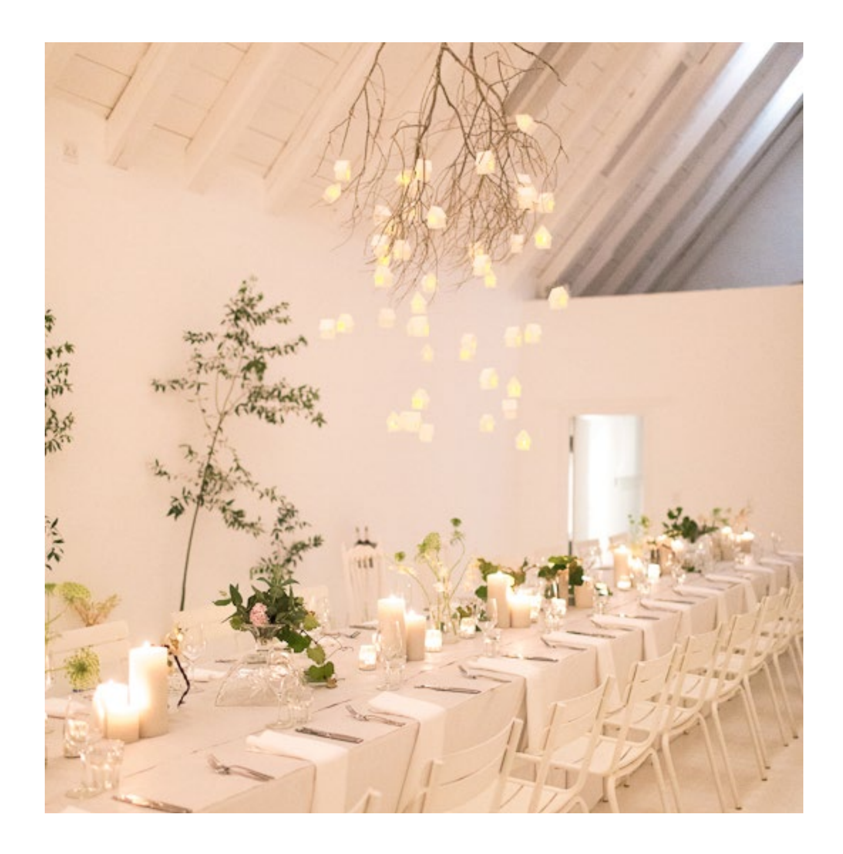
OLD CELLAR Seats 100 guests at one long table

Dine in style in our original and historic barn-style building with its white walls and thatched ceiling.